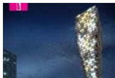
Photos: A 52-storey 'Twisty Tower' proposal for Vancouver