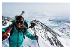
A Ski & Board Guide for making the most of the snow scene