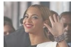
Video: 'Life Is But a