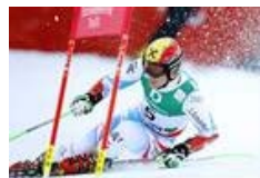
Photos: Thrills and spills at world slalom contest