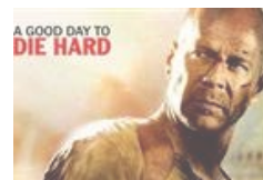
A Good Day to Die