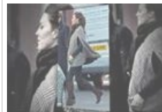
Video: Duchess Kate