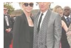
Grammy Awards: Red